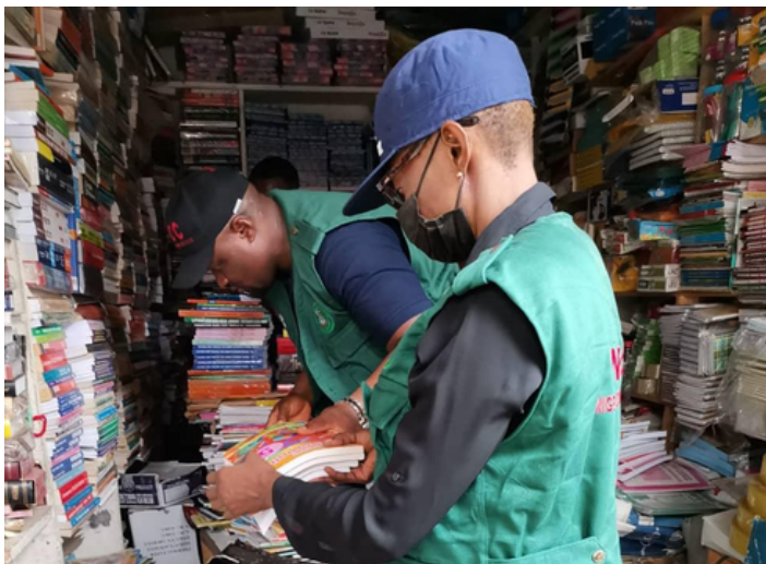
Copyright Inspectors at work during a book anti-piracy operation at the Wuse Market, Abuja, 23rd March 2022.